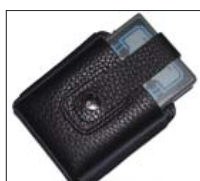
LP Stylish Leather Pouch