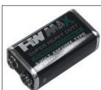
6F22 9V Battery