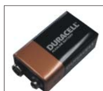
6LR44 9V Battery (Alkaline)